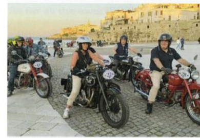
The square of Marina Piccola

On the way back from Manfredonia, a visit to the city center of Vieste was organized with the exhibition of the participating motorcycles on the square of Marina Piccola, highlighting the historical and technical characteristics of each bike.