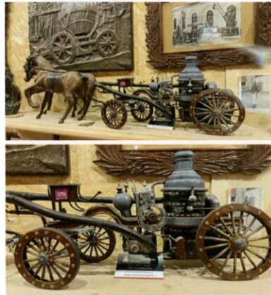
Fire pump from early 1800s

The first ride took the group from Vieste to Manfredonia to visit the fire brigade museum with an overview of the means used, methods of intervention, uniforms, equipment and many other objects in the various eras from the beginning of the century to the modern era. A truly meritorious work due to the passion of a lifetime committed to creating a unique collection by the patron Michele Guerra.