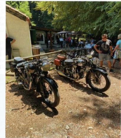
Sunbeam and Itala with Rudge Python engine