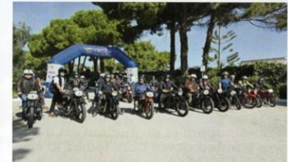
Participants in the regularity contest