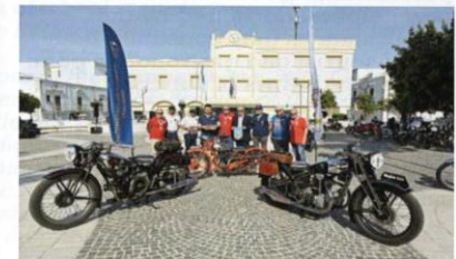
The authority of Peschici with ASI rep