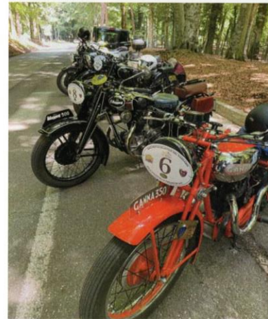
Ganna 350 Rudge engine

The second ride was more challenging as it involved 3 steps: 1. regularity race with times taken at the start and back to the hotel 2. visit of the Gargano National Park and the Umbra Forest with lunch at the typical restaurant 3. exhibition of motorcycles in the city of Peschici and return to the hotel in Vieste for dinner